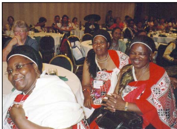
Above: Ladies at dinner