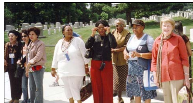
Above: Arlington Cemetery