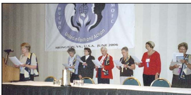
Above: Morning Prayer