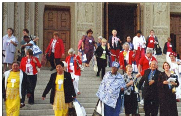
Above: On the steps of the Basilica of the National Shrine of the Immaculate Conception, Washington