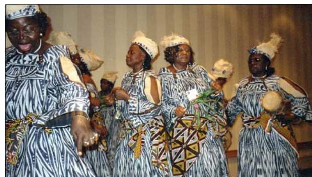
Above: Dancing Ladies